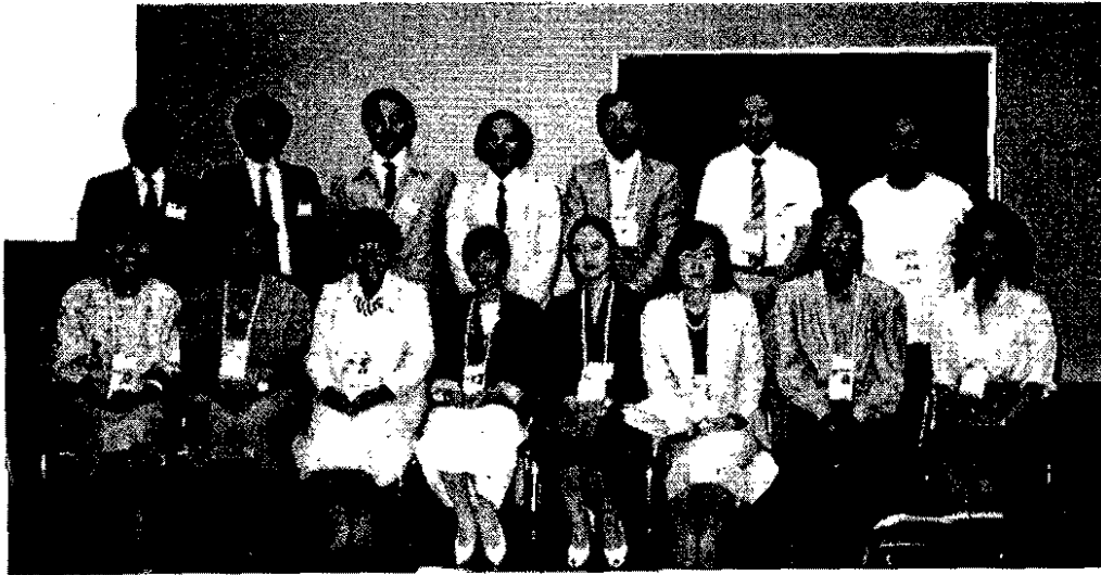
A fresh start with young members.